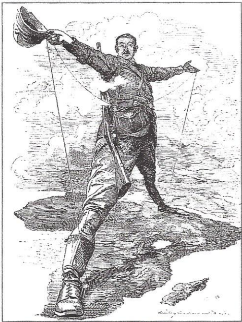
Figure 1.4 A cartoon of Cecil Rhodes, published in the British magazine Punch in 1892; it links Rhodes' name with the ancient statue known as the Colossus of Rhodes

Rhodes was a British-born businessman who made a fortune from the extraction of diamonds in South Africa. He was prime minister of Cape Colony between 1890 and 1896, and a strong supporter of British imperialism in Africa. However, he believed that British settlers and local governors in Africa should be in charge, rather than being ruled from London.