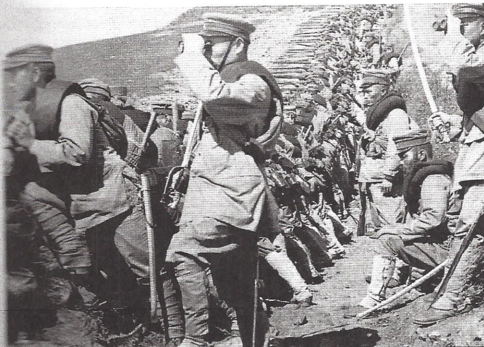
Figure 1.1 Japanese soldiers in the trenches during the Russo–Japanese War in 1905

The policy of extending a nation's power by gaining political and economic control over more territory. This is sometimes referred to as colonialism.