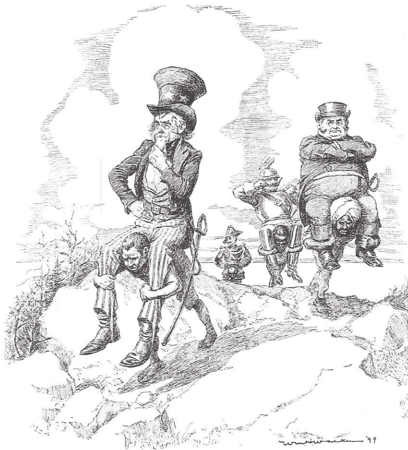
Figure 1.3 A satirical cartoon from 1899 showing Africans carrying figures from the USA and Britain (Uncle Sam and John Bull) who represent 'civilisation'

While recognising that Africans may have benefited from the British presence on their continent, Lord Lugard openly accepted that Britain's main motive was to serve 'our own interest as a nation' by enhancing trade. It is interesting to note that he clearly sees nothing wrong in this, claiming that it was Britain's 'right' to take such action and quickly dismissing the views of those who argue that Africa 'belongs to the native'. In asserting that Britain had every right to take possession of African land in order to address its own national interests, Lord Lugard was clearly implying that the rights and needs of Europeans outweighed those of Africans. In this, he was conforming to the widespread belief in European racial superiority.