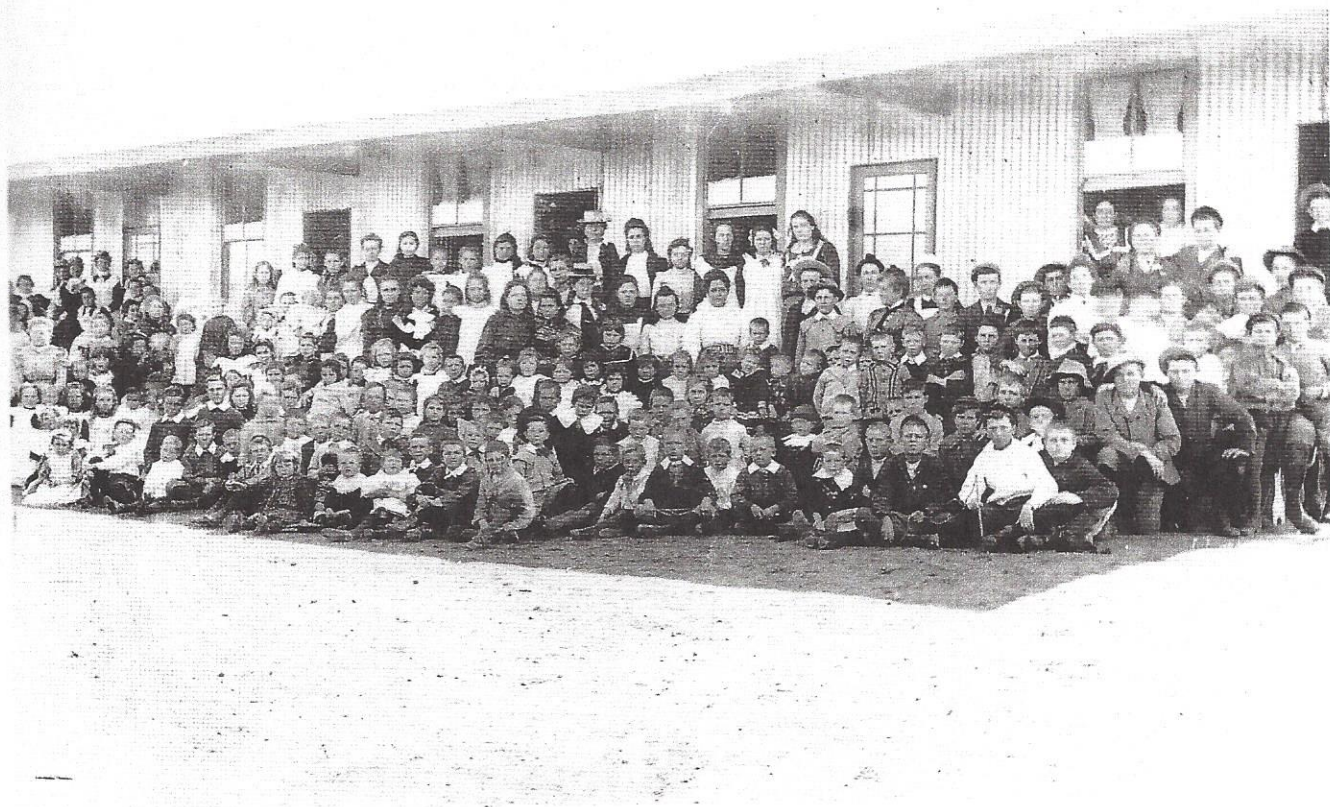
Figure 1.6 Boers in a concentration camp during the Second Boer War

As a result of this, British politicians – and public opinion in general – grew divided over whether Britain should continue its imperialist policies. Many people believed that Wilhelm II's telegram to Kruger was a clear sign that Germany would support the Boers in the case of future conflict with Britain. Feeling both isolated and vulnerable, Britain began seeking allies elsewhere in the world, starting with Japan (see page 26).