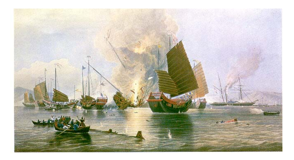
British navy sinking Chinese Naval Junks in Canton